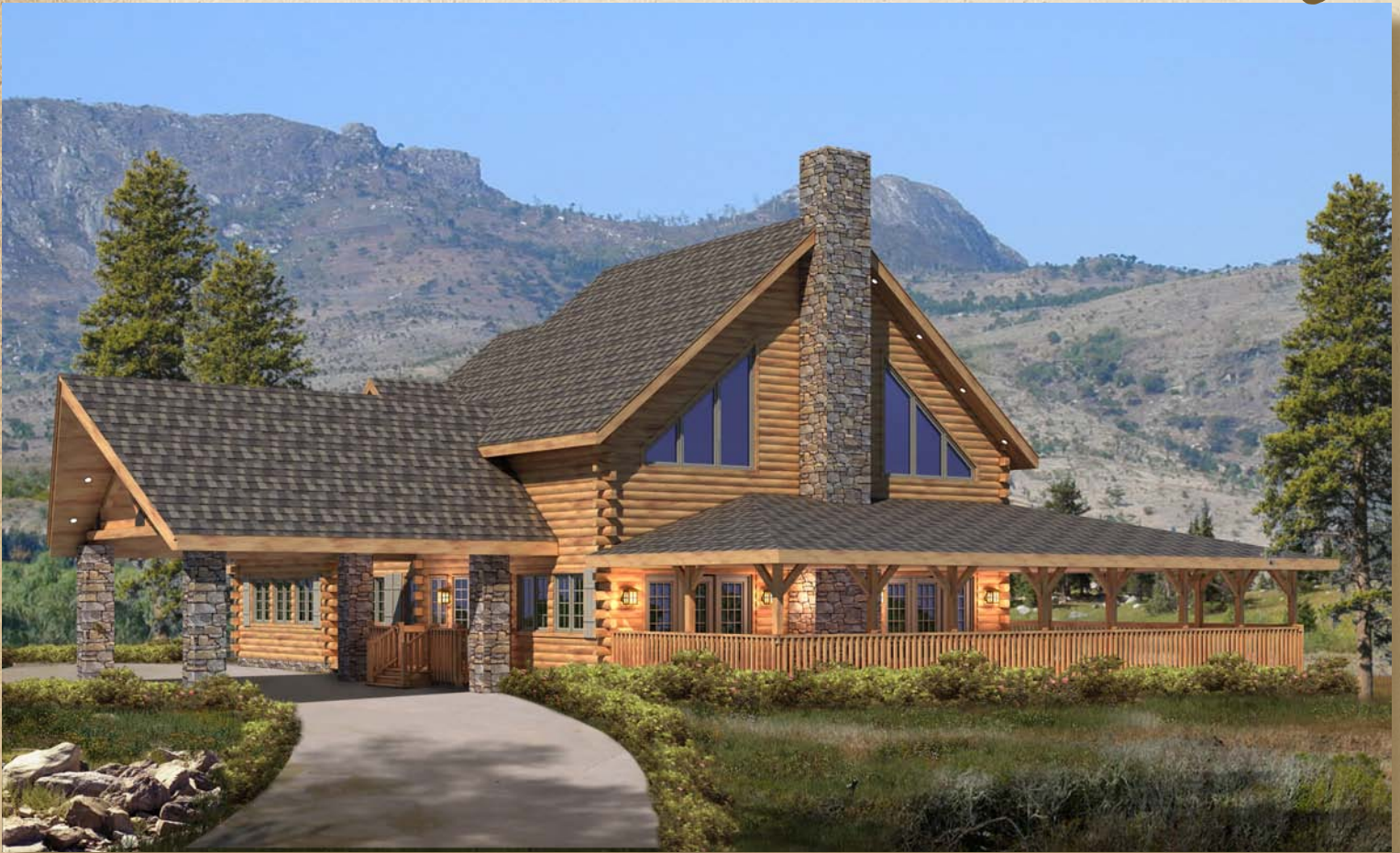
2,969 total sq. ft./276 total sq. m.