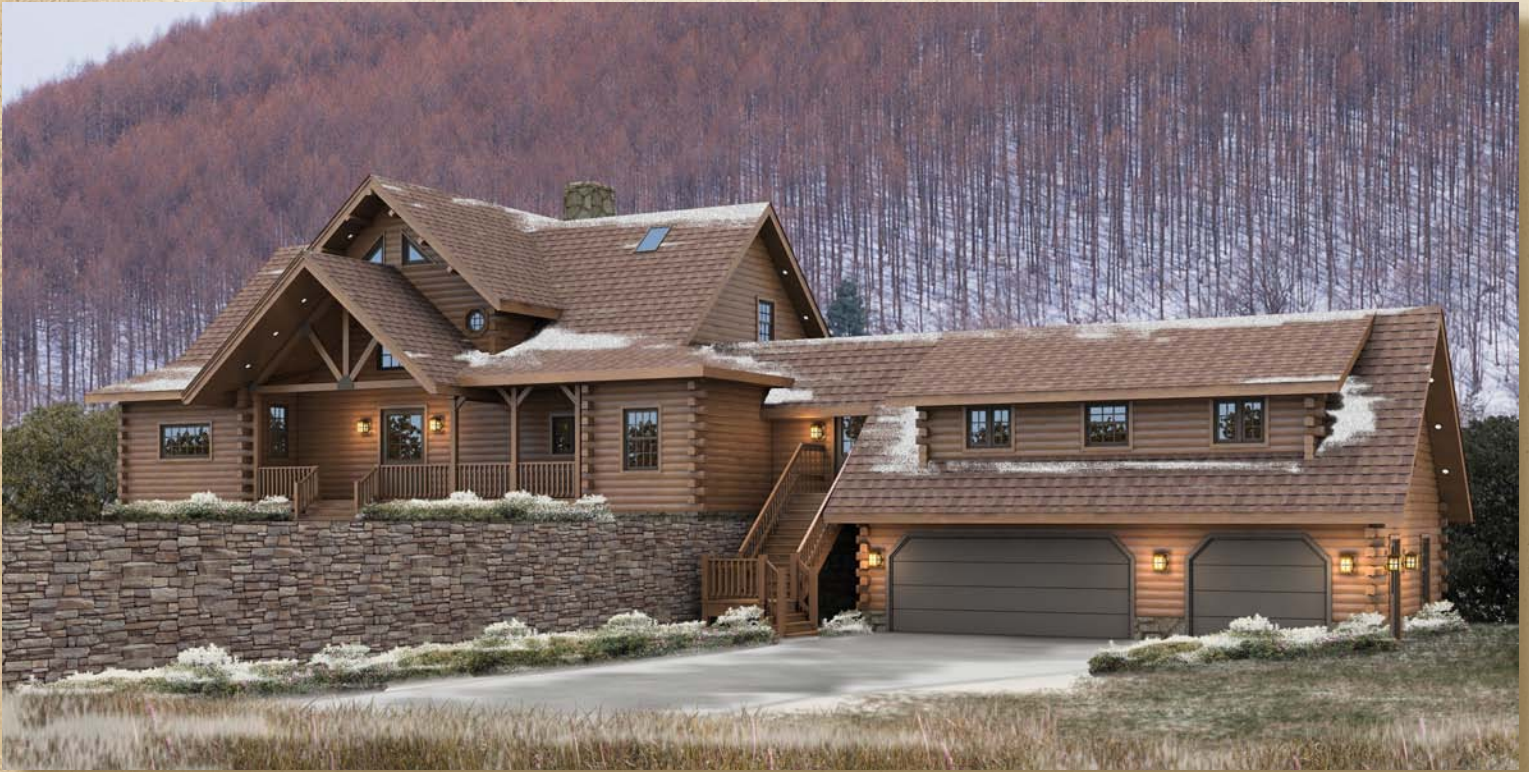
3,614 total sq. ft./336 total sq. m.